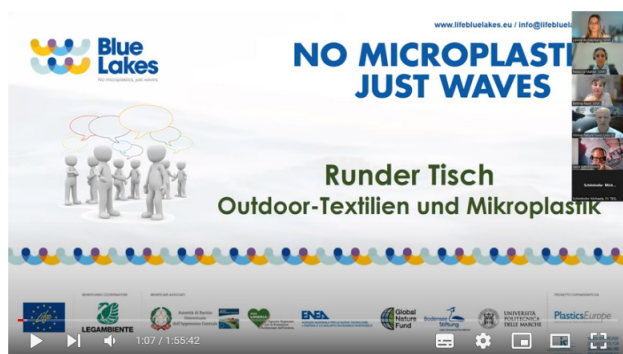
Round Table vom 21.10.22: Mikroplastik in Outdoor-Textilien